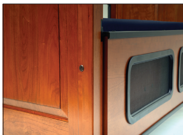
CLEAR OR MESH WINDOW SAFETY RAILS

Most of the safety features and benefits that are offered with SleepSafe® Beds are available, however product limitations will apply. 4 to 6 weeks for production. Please contact us at 866-852-2337 for more details.