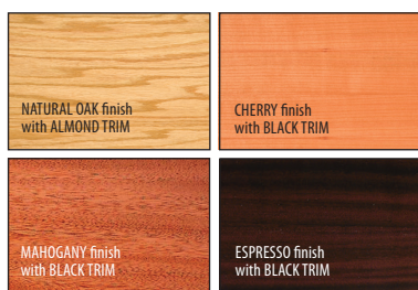
WOOD FINISH CHOICES