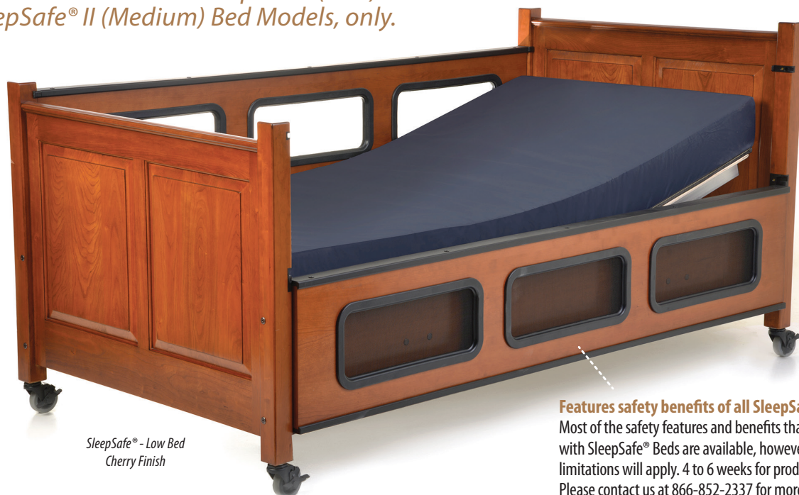
SleepSafe® - Low Bed Cherry Finish

Available in Twin Size SleepSafe® (Low) and SleepSafe® II (Medium) Bed Models, only.