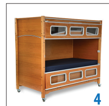
Opening sequence with upper safety rail fastening to SleepSafer® Tall Bed Extension for quicker and easier access.