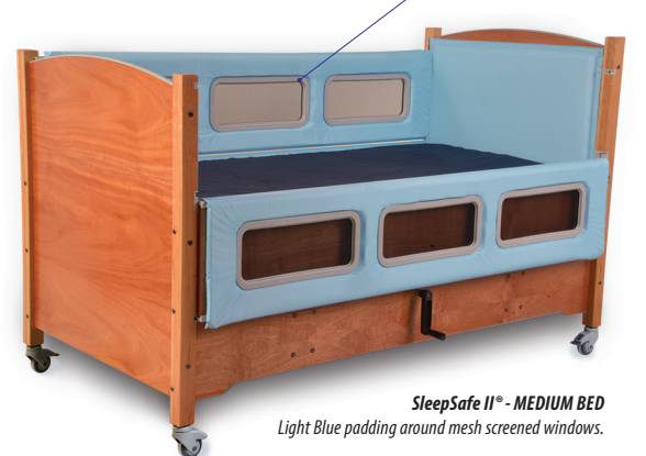
SleepSafe II® - MEDIUM BED Light Blue padding around mesh screened windows.