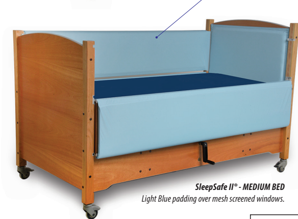
SleepSafe II® - MEDIUM BED Light Blue padding over mesh screened windows.