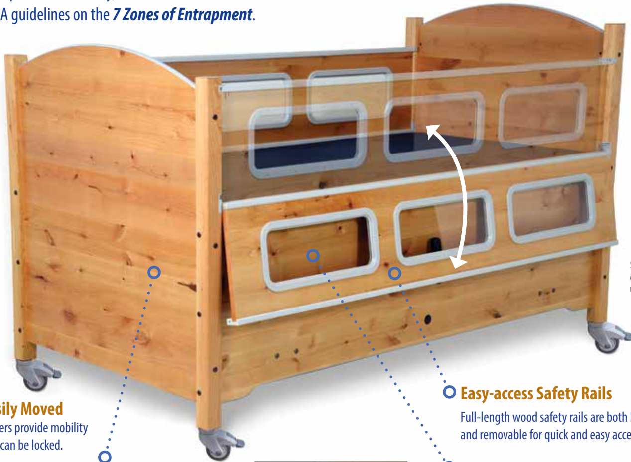
SleepSafe® II Medium Bed with Alder finish

THREE MODELS of SleepSafe® Beds are available in TWIN, FULL and QUEEN sizes with safety rail height protection ranging from 8¾" to 53" above the mattress depending on the configuration. Appropriate SAFETY RAIL HEIGHT is based on the activity level of the user, with more active users requiring additional height.