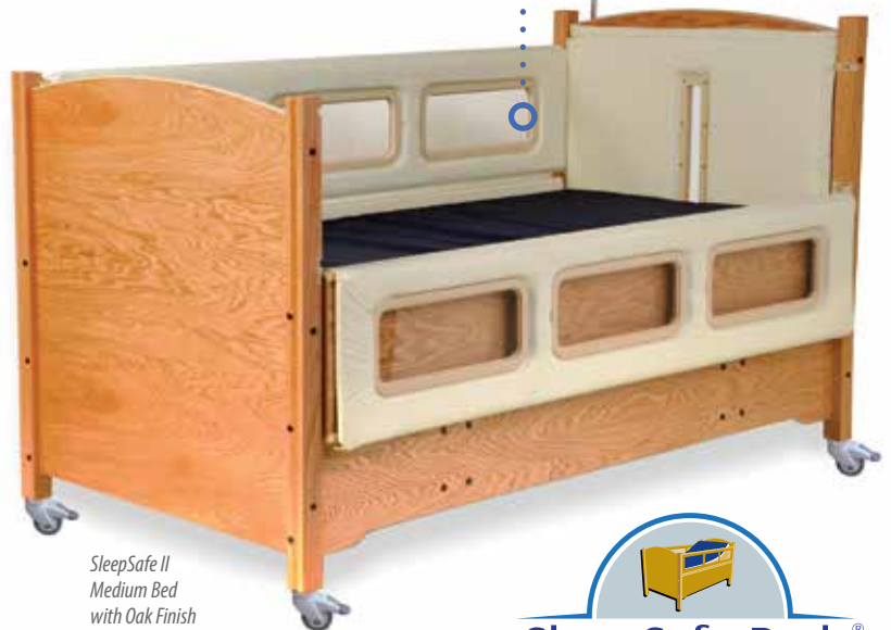
SleepSafe II Medium Bed with Oak Finish

You can mix and match the colors for a truly unique bed. Please call for details!