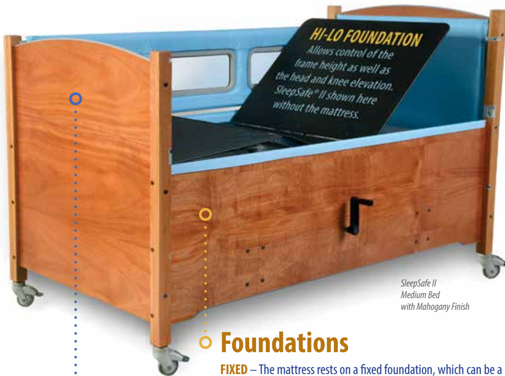
SleepSafe II Medium Bed with Mahogany Finish