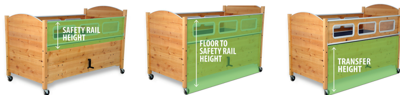
Photo Reference Guide for Bed Measurements