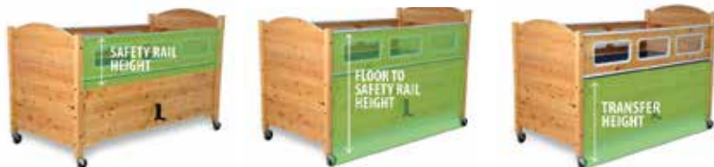
Photo Reference Guide for Bed Measurements