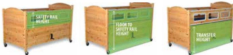
Photo Reference Guide for Bed Measurements