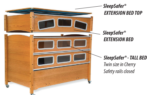
SleepSafer® EXTENSION BED TOP

SleepSafe® Beds are built to order, offering twin, full or queen size safety beds in fixed, articulating or HiLo foundations, in electric, and/or manual configurations; padding; wood or color selections, and other helpful options for those with special needs.