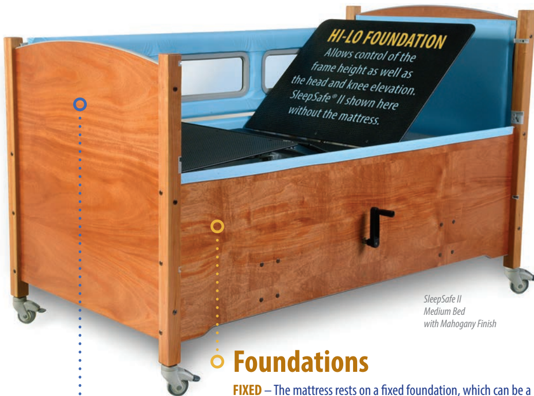
SleepSafe II Medium Bed with Mahogany Finish