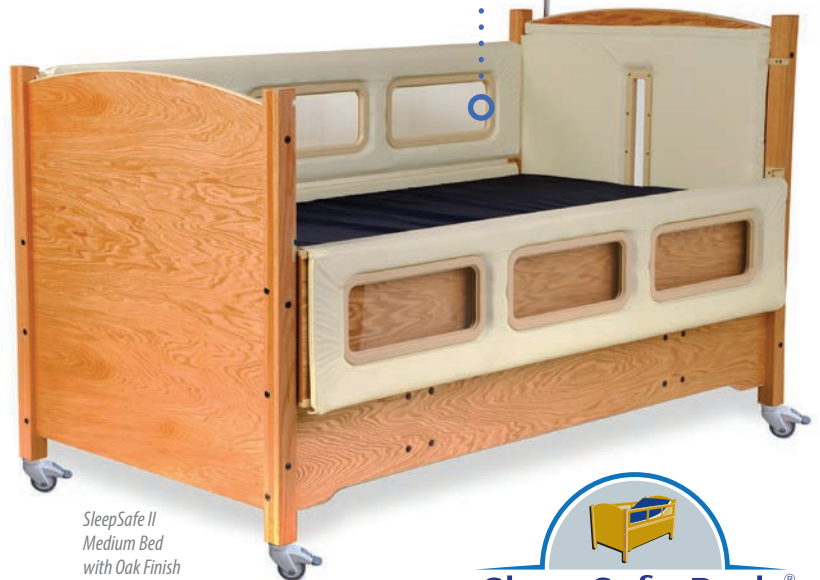
SleepSafe II Medium Bed with Oak Finish

White, Blue, Green, Red, Yellow, Orange, Purple, Pink, Black, Dk. Brown, Lt. Brown and Gray