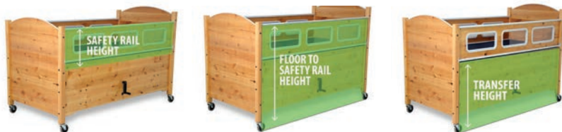
Photo Reference Guide for Bed Measurements