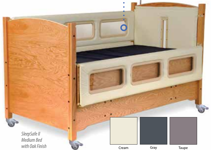
SleepSafe II Medium Bed with Oak Finish Cream Padding

White, Blue, Green, Red, Yellow, Orange, Purple, Pink, Black, Dk. Brown, Lt. Brown and Gray