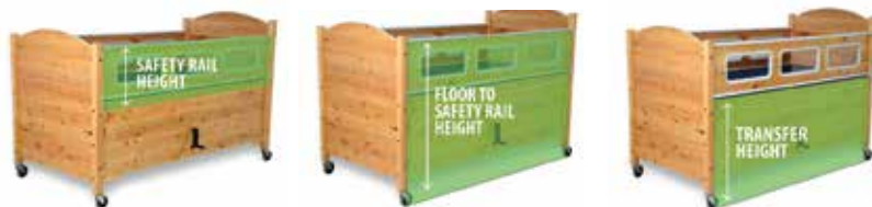
Photo Reference Guide for Bed Measurements