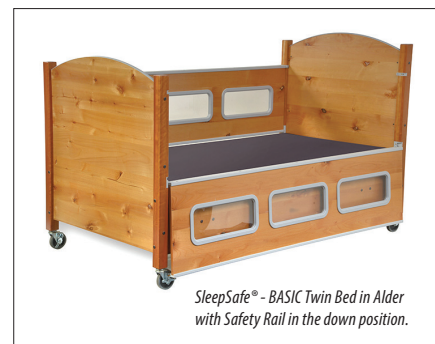
SleepSafe® - BASIC Twin Bed in Alder with Safety Rail in the down position.

SleepSafe® Beds is a domestic manufacturer of custom safety beds, featuring safety side rails, designed to address falls and entrapment for those with physical and cognitive disabilities. Models include SleepSafe®- Low Bed, SleepSafe® II - Medium Bed, SleepSafe®- Tall Bed and SleepSafe® Extension Bed, each offering progressively more safety rail to mattress height.