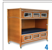
Opening sequence with upper safety rail fastening to SleepSafe® Extension Bed for quicker and easier access.