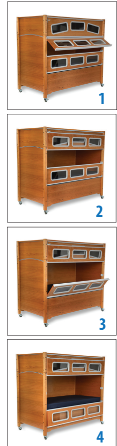
Opening sequence with upper safety rail fastening to SleepSafe® Extension Bed for quicker and easier access.