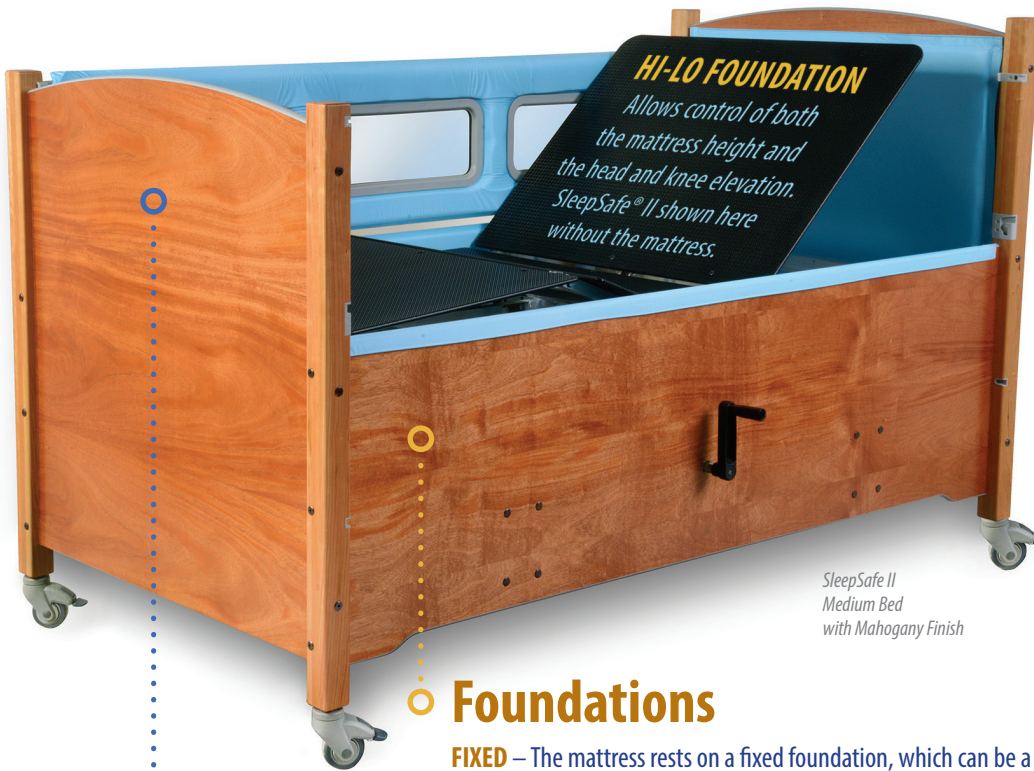
SleepSafe II Medium Bed with Mahogany Finish

An IV pole kit and a 2"x18" channel for medical tubing, may be ordered with your bed.