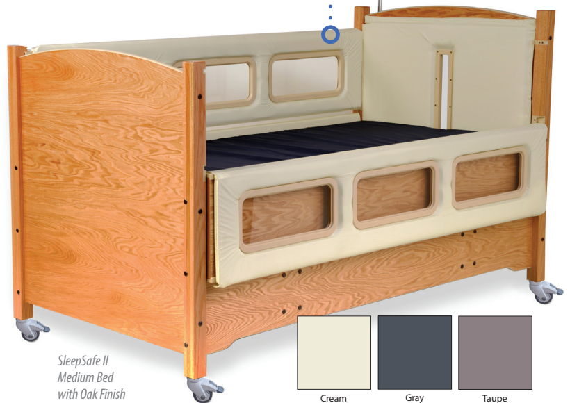
SleepSafe II Medium Bed with Oak Finish Cream Padding

White, Blue, Green, Red, Yellow, Orange, Purple, Pink, Black, Dk. Brown, Lt. Brown and Gray