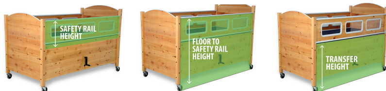
Photo Reference Guide for Bed Measurements